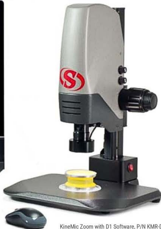
KineMic Zoom with D1 Software, P/N KMR-D1